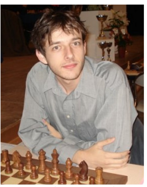
International Master David Pruess

I've been making that decision more and more often lately, and I want to feel free to play e4, and stop being so worried. My goal for round 5 was actually simply to play 1.e4 in order to help myself get over this growing fear.